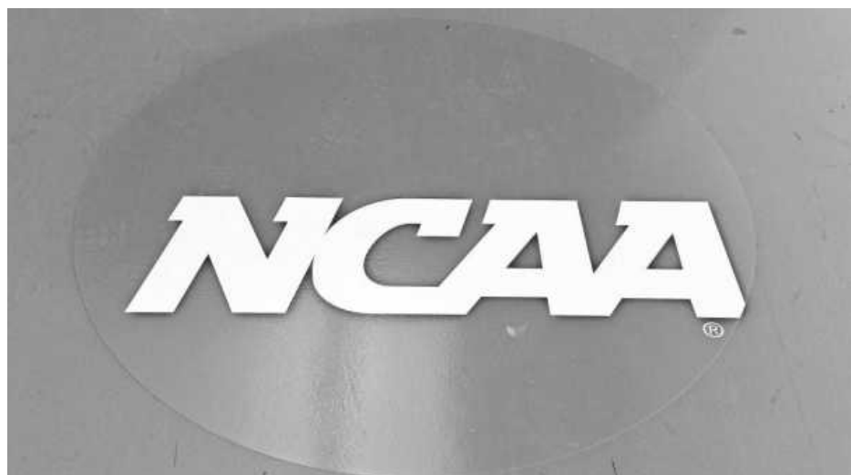
The NCAA is facing another lawsuit over athletes' names, images and likenesses.